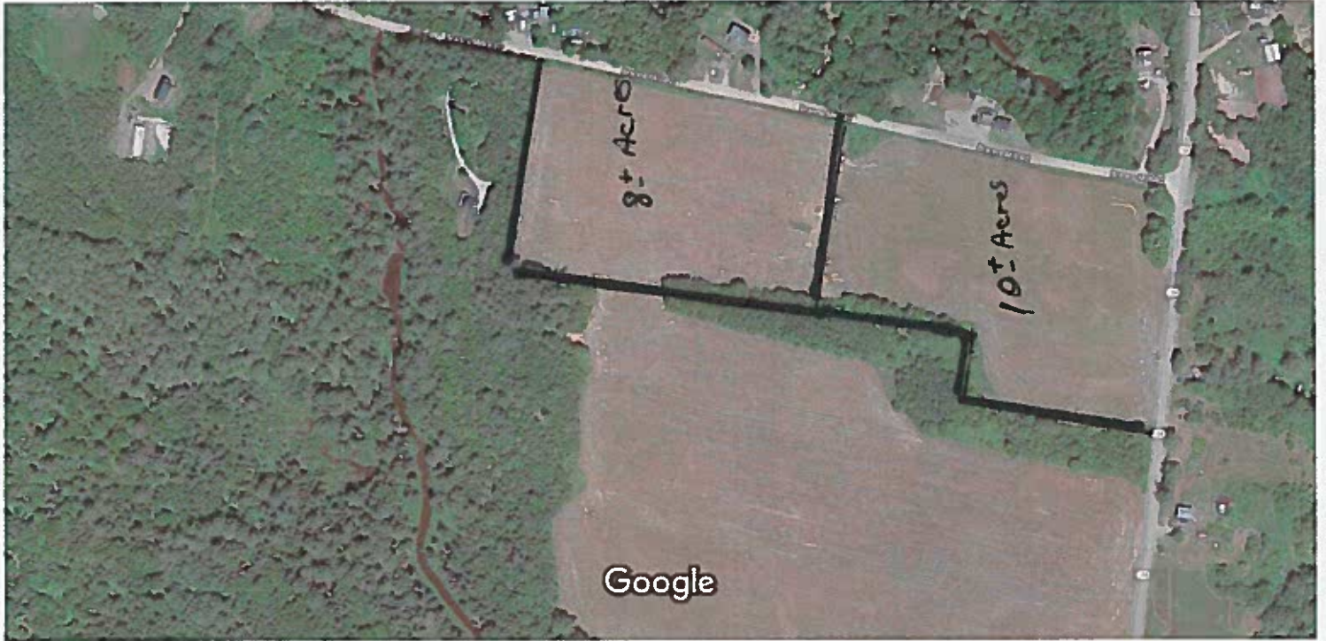
100 ft